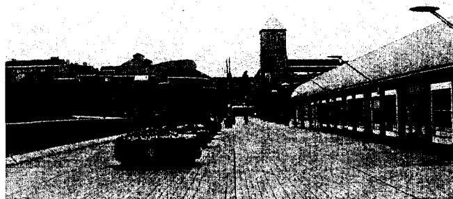
Tokyo Metropolitan University – Site of the 28th Symposium on Electro-Mechanical Devices.