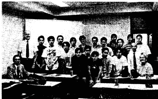
Seminar attendees at Tamagawa University.

During the last 28 years, EM devices have been successfully applied to various modern digital and/or communication systems, and their market has significantly and unexpectedly grown. Quartz oscillators are now widely used, not only in clocks and watches, but also in most electronics products as highly stable time and frequency standards. SAW devices established their status as high performance filters in VBF and UBF ranges. In accordance with such situations, the annual symposium has frequently