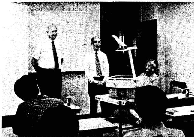
Question time at Tamagawa University seminar.