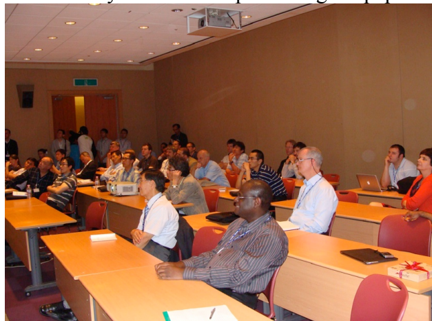
Audience at a CASEO TC Special Session at ISCAS 2012 in Seoul, Korea.