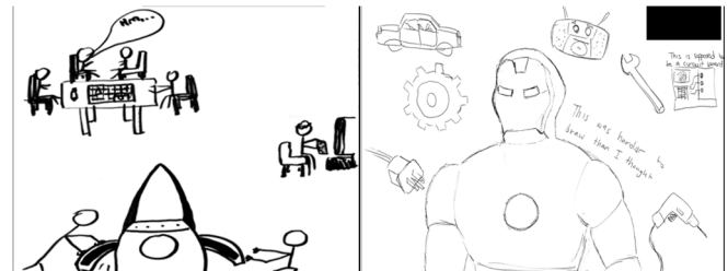
Fig. 2. Example of the Human & Technical theme

The second theme is focused on Technical aspects (Figure 2, part 2). In this theme, we included parts of the drawings where students had things (concrete objects) related to technical aspects of engineering, including tools, gears, bridges, buildings, etc. This theme represented a big majority of the drawings as students pre-conceptions of engineering appear to be very focused on the technical aspects.