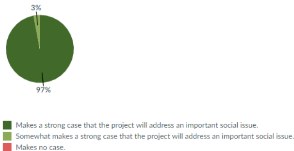
Figure 2: Assessment results of how well a project meets GE area S and ABET criteria 2 and 4, EE 198A spring 2017

Each semester it seemed that too many students did not take the GE writing assignments seriously. Some would not include any identifiable thesis statement that could be proved, or would address a completely different topic, even though a detailed rubric was provided. This was addressed in two ways. The first is that as part of the GE approval for the capstone/GE integration package was the requirement that all GE assignments must be passed with a 70% or the student would not pass the capstone course. While this was not enforced as the pilot was brought on line, as soon as the faculty informed the students of this policy, student effort on these assignments increased dramatically. The other method to improve student work in this area was to provide sample assignments.