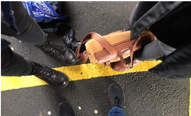
Fig. 1- Sea of Shoes

coming to university and how there are a lot more people... It's like a sea of shoes if you will...I think just maybe keeping my head down a bit to start with when I felt I didn't know anyone and didn't fit in. It was easier to look at feet."