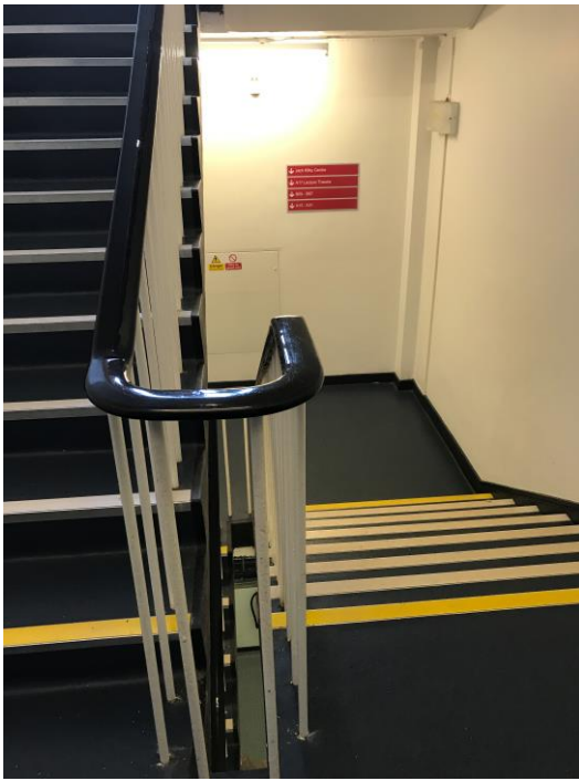
Fig. 6 - Ups and down of uni life

The emotional rollercoaster was highlighted by [P24] in Fig. 6. “It’s all about the ups and downs that you are going to experience in uni. There are going to be some good days and some bad days.”