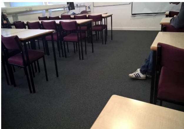
Fig. 8 - New me: getting in early

Many of the participants included the word “new” in their discussion and talked of changes in themselves as new me, or a new kind of student; changes in their home life, like [P22] who took the photograph in Fig. 7 stating “It feels like the start of a new beginning. I’m finding a way to get settled down again and into university life.”