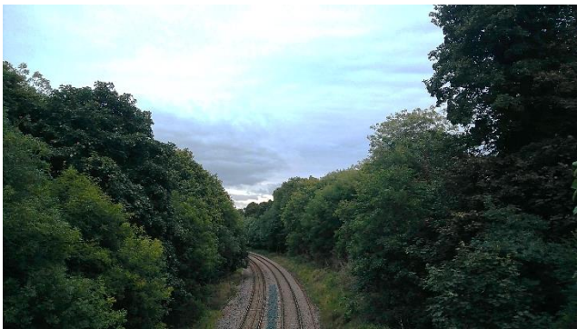
Fig. 2 - New path, new journey, not knowing the destination

[P3] produced a photograph of the campus at night time. They identified themselves as a "night time student, this is associated with university, the college campus is 9 to 5 and then you go home. Studying after hours isn't an option." The change in learning style was also highlighted by [P1] stating "at Uni you are reaching way more out of your depth. There's proper group work and you have to really come together." An altered identity was emphasized by [P2] who commented: "I've moved out of my family home, got my own space, am making my own decisions." This change in circumstance has allowed them to grow way beyond the university study but in an individual context as they become an independent adult.