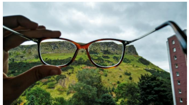
Fig. 4 - A new way to see, a new way to learn

[P21] also emphasised the change in teaching style in Fig. 4 - "it's about university and how here's it's a different way. It's different methods of teaching and a new way to learn. The glasses kind of represent how I have more tools to be able to learn and to see more clearly in some ways."