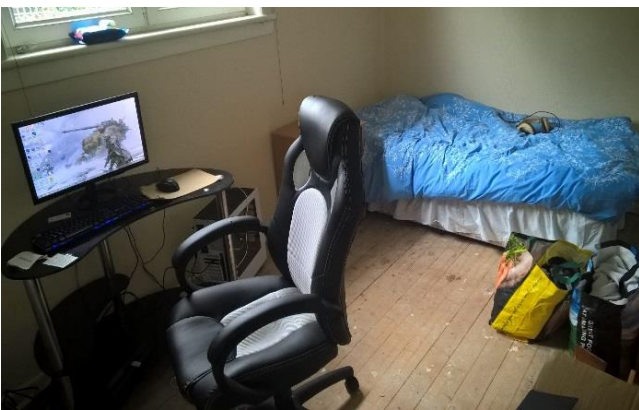
Fig. 7 - New beginnings: moving into a new home

The emotional rollercoaster was highlighted by [P24] in Fig. 6. “It’s all about the ups and downs that you are going to experience in uni. There are going to be some good days and some bad days.”