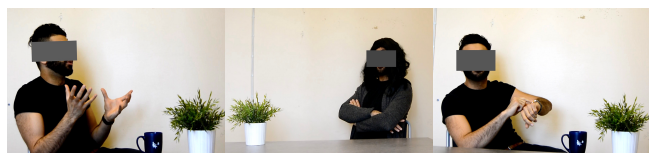
Fig. 3. Screenshots from video interview, created for “Complex IT systems in large organizations” 2017-18 module.

In this course the students make short video clips to capture interviews they conduct with key persons in industry. See Figure 3 for screenshots of an example. Each interviewee has to meet a group of three students who have prepared a set of questions related to the work of the interviewee. The video clips are shared among the students and used as a base for discussion regarding some of the key learning goals in the course. Finally, workshops with students are carried out that are based on the learning theory of constructive controversy [47] and the technique affinity diagram to ensure peer learning.