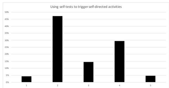
Fig. 3. How do you like the approach to trigger self-directed research activities and discussions in the self-tests? (Question in javawork2016 post-course survey (n=214).