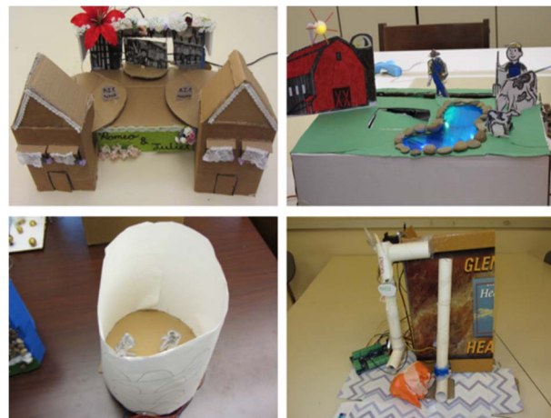
Fig. 2: Four robots illustrating different degrees of Mechanical Sophistication, and Communication and Artistry: (clockwise from top left) audience consideration with direct motion; audience consideration with transformation mechanism; practical construction with transformation mechanism; practical construction with direct motion.