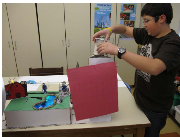
Fig. 1: A student works a robot which illustrates the Mechanical Sophistication tier of “Transformation Mechanism”. This robot uses counterweights, shown in the student’s hand, and a pulley system to rapidly open the red paper curtains when the robots’ servo opens a trapdoor supporting the counterweights.

Indicating an even higher tier of Communication and Artistry, some robots incorporate novel ideas and artistic